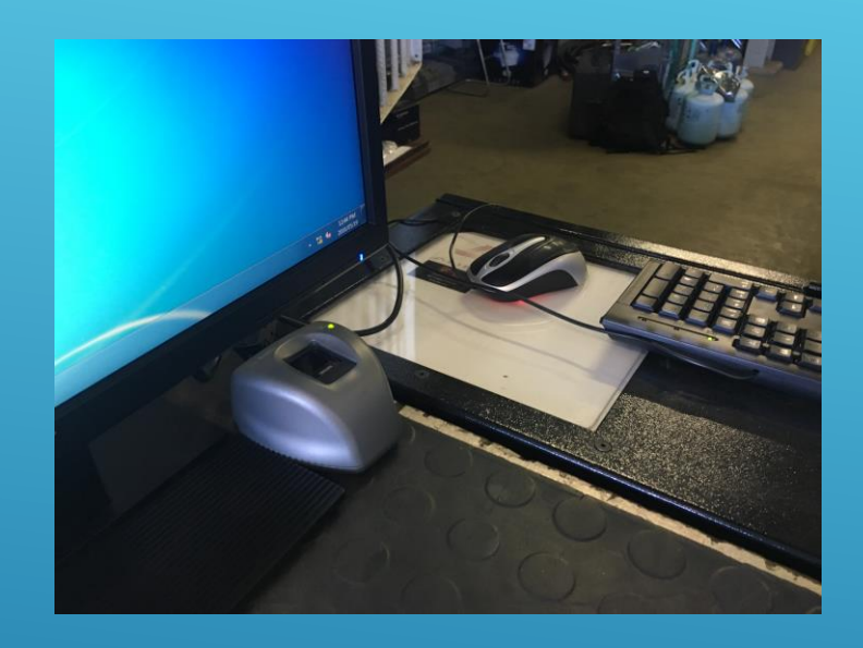
Fingerprint Enrolment Device