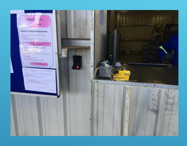
IN – Fingerprint Scanner