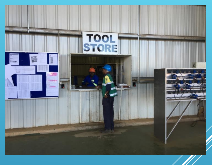
Storeman & Employee

RFID Tag examples (many different types available)